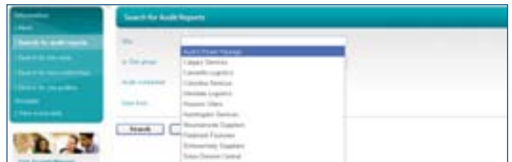
Example of the audit report search screen