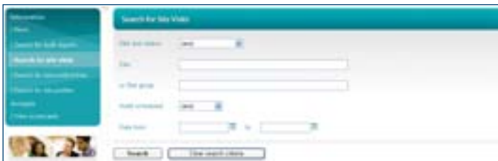
Example of the schedule search screen

This feature allows you to search for audit reports from sites where audits have been conducted. You can also review the schedules of audits. You can then click on a completed audit to see the audit report for a particular location or supplier along with the related audit schedules.