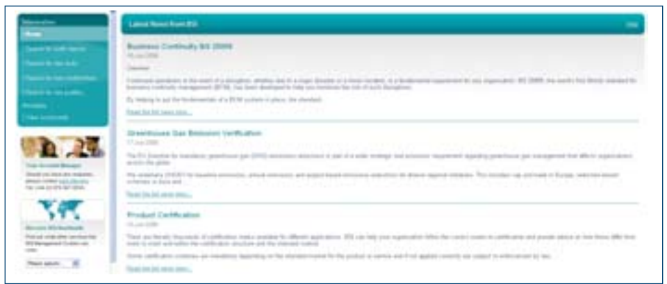
A customized BSI Portal homepage

BSI will add information, relating to your industry on an ongoing basis to keep you up to date with all the latest and most relevant news.