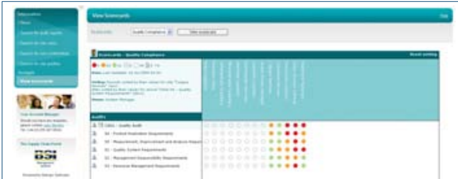
Example of a scorecard

Amber indicates "reasonable performance or partial compliance".